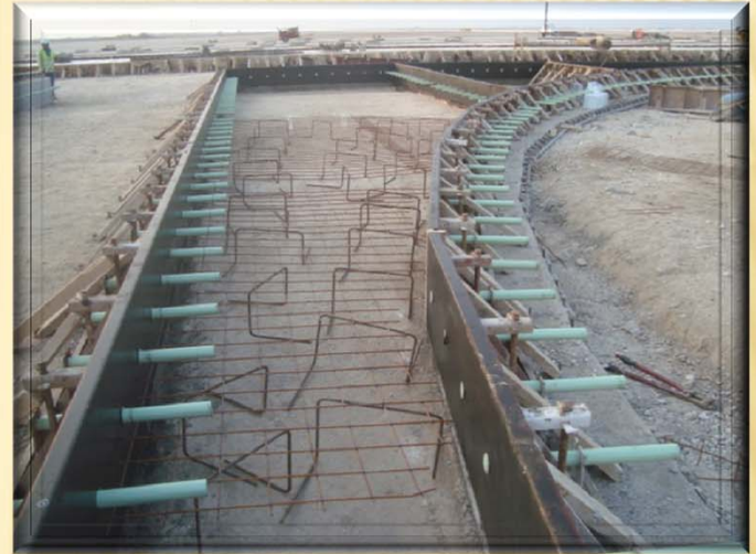
Forms, dowels & reinforcement