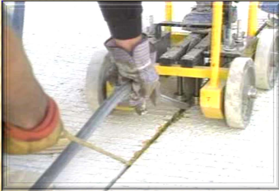
Placing preformed joint sealer