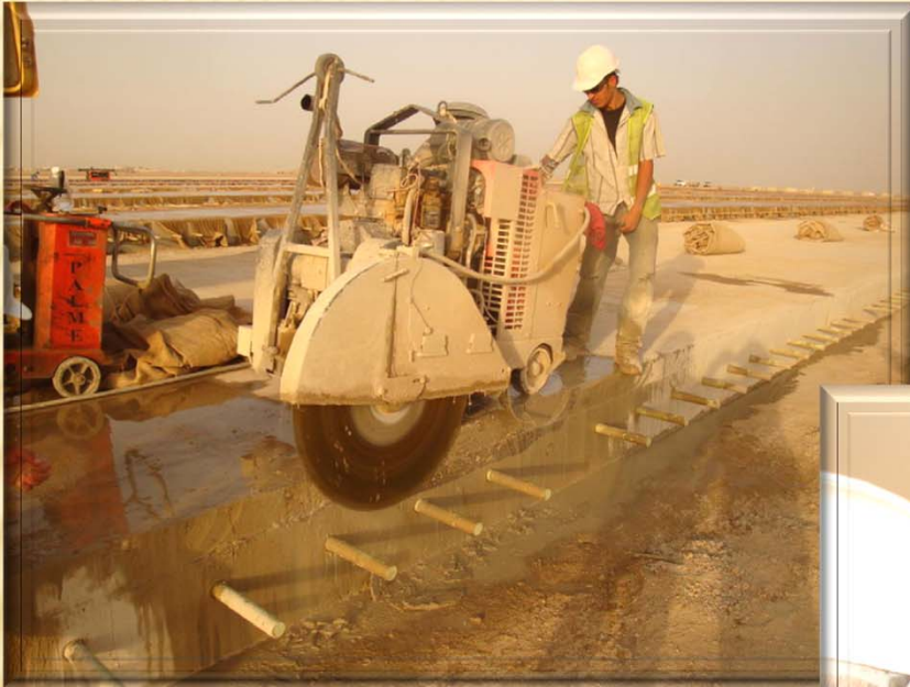
Saw - Cutting