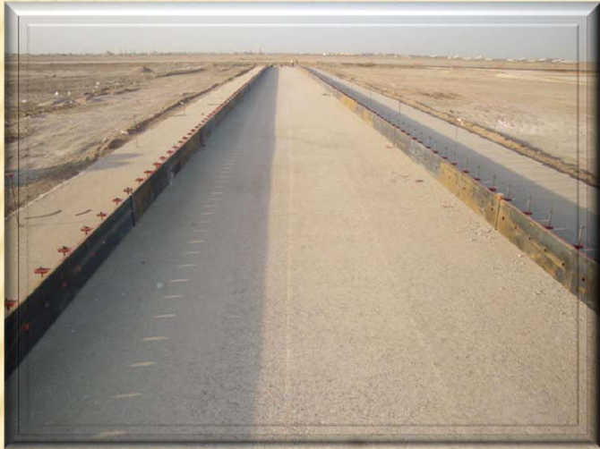
Subbase & Forms